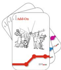
Fig. 3 Pattern card set

Re-combining existing concepts is a powerful tool to break out of the box and generate ideas for new business models. To ease this process, we have condensed the 55 patterns of successful business models into a handy set of pattern cards. Each pattern card (see